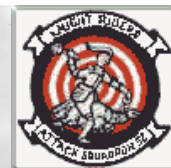
LCDR RODERICK B. LESTER