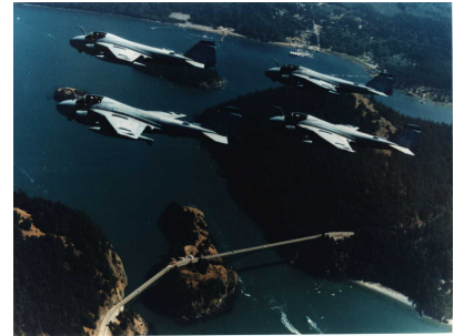
A-6s over Deception Pass on Whidbey Island.

Send us your after action photos and we will publish them on our website and in the next issue of the Windscreen.