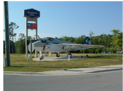
A-6E BuNo 164378 at the Havelock Aircraft Museum and Visitor's Center.