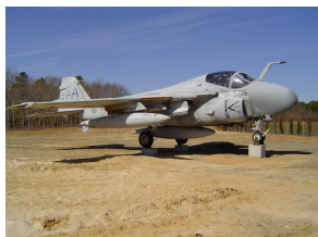
The last A-6 off the line rests at the Grumman Memorial Park in Calverton, NY.

Grumman Memorial Park is off to a great start. Today Plant Six, where final assembly of F-14s, A-6s, EA-6Bs, and E-2Cs, and Plant Seven, Flight Test, sit empty and silent, their fate yet